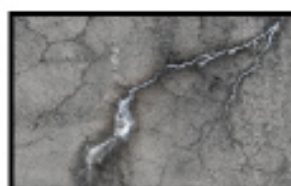
Plastering without DURAMIX MORTAR ADDITIVE

All information contained in this brochure is only act as a general guidance as it is not possible to give specific instructions for various site conditions or to control the applications.